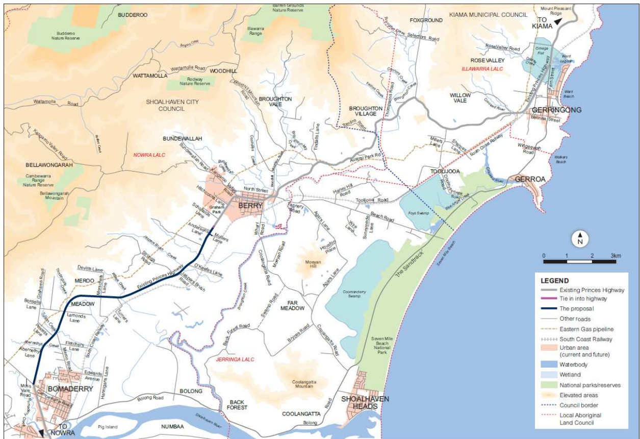
Figure 1-1 Project location

Figure 1 provides an overview of the project location.