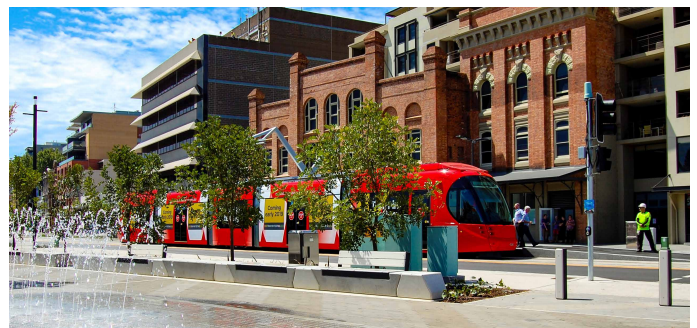
Newcastle Light Rail system is characterised by Australia's first application of catenary-free operation with supercapacitors.