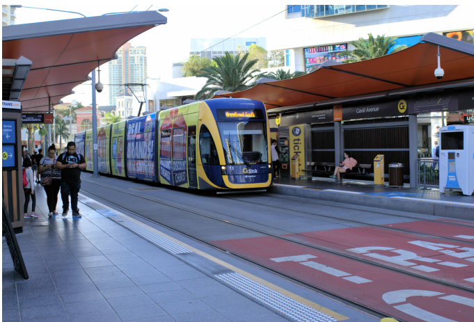
On the Gold Coast, approximately 30,000 daily trips are made on Glink which operates to 99.9% punctuality.

We design light rail networks that optimally align with other interfacing transport modes and which maximise transport capacity for passenger demand.