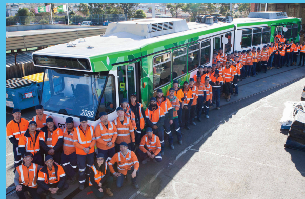
Built in Melbourne over 30 years ago, the above tram is the first of 450 trams to be restored to their original condition.