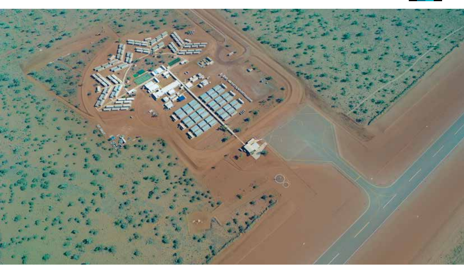
Gruyere Gold Project site