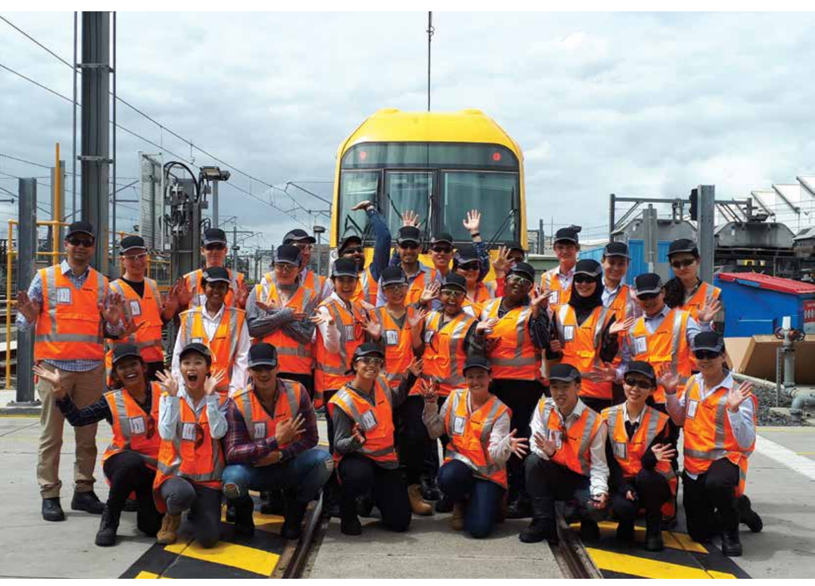
Our new graduates will be spread around the country working on various projects over the next two years.