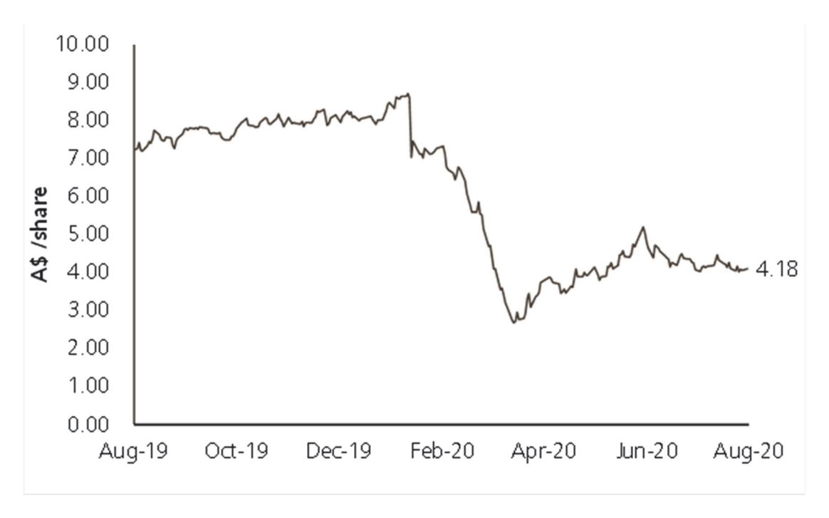
The above trading data has been sourced from IRESS and referenced in this Takeover Booklet without their consent.