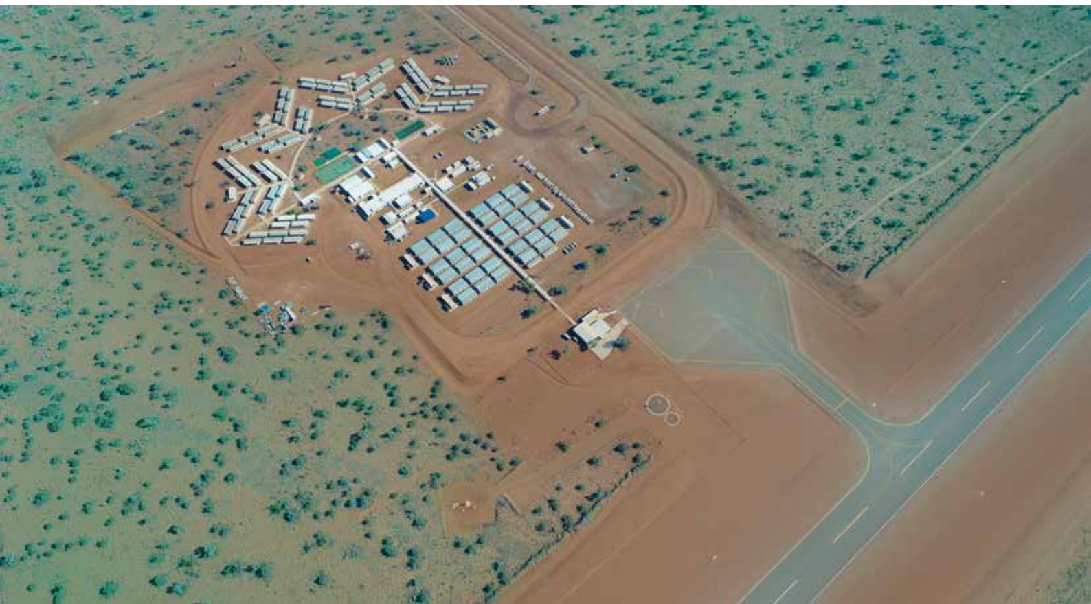
Gruyere Gold Project site